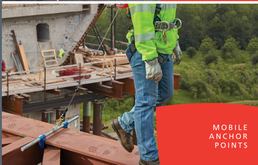
MOBILE ANCHOR POINTS