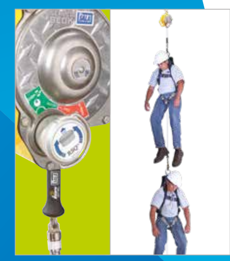
Automatic Descent Mode Self Rescue Descent