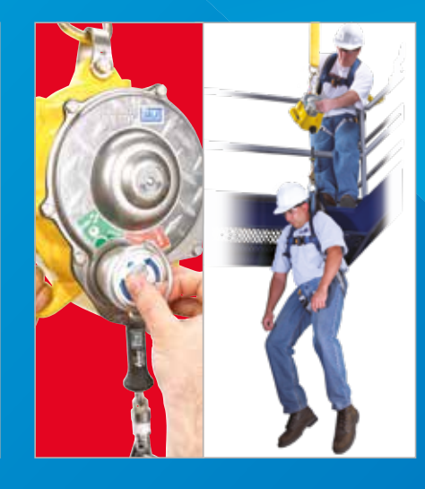
Fall Arrest Mode Assisted Rescue by Hand