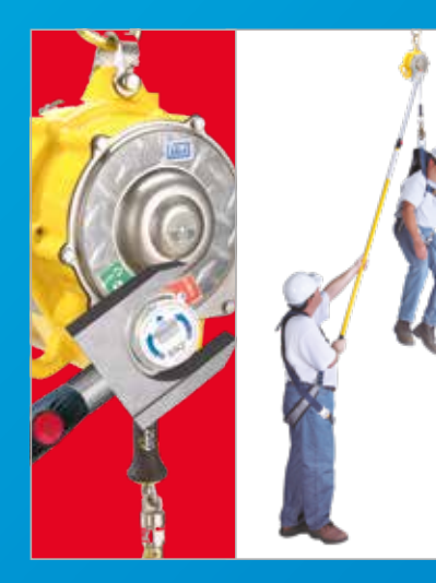
Fall Arrest Mode Assisted Rescue by Hand

Assisted Rescue Options 'Engage' The Descent Mode Traditional assisted rescue operations may also be conducted.