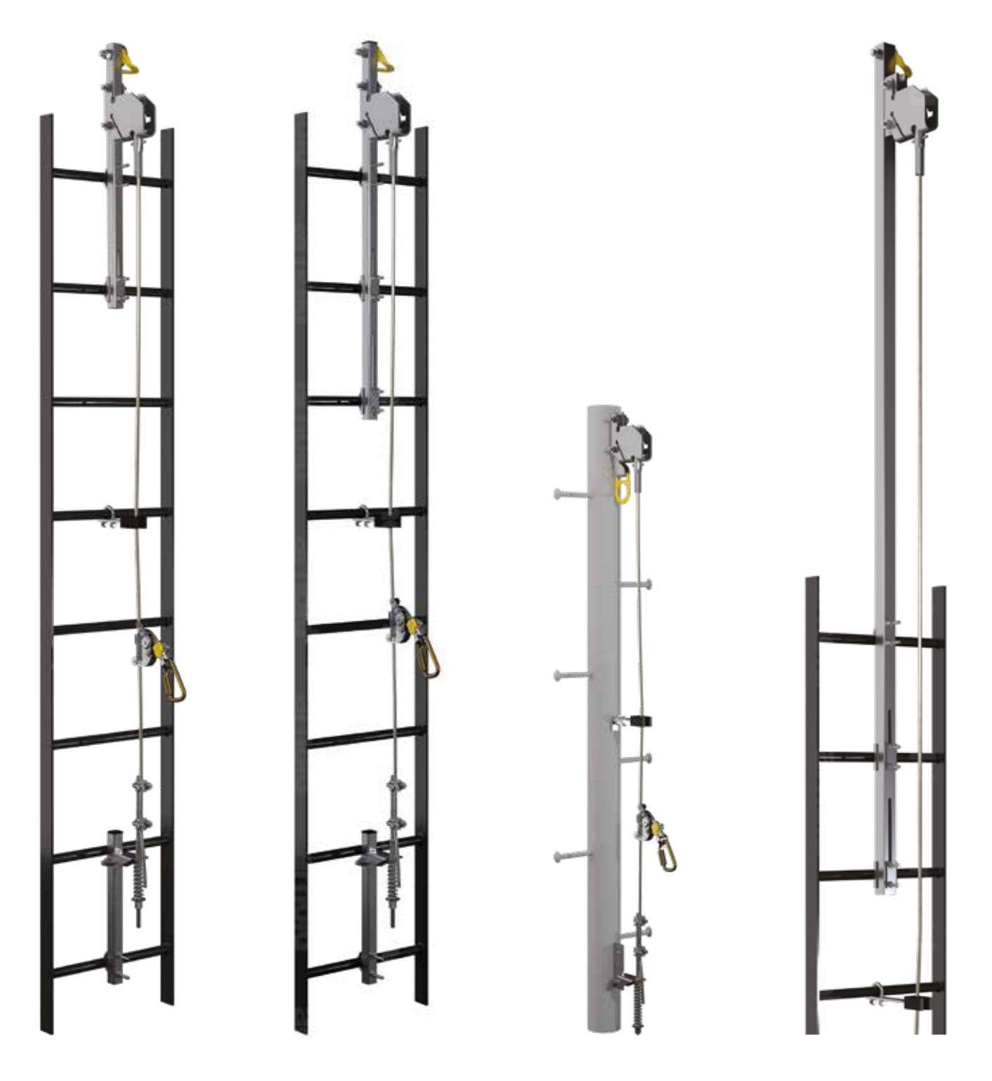
Rung, 2 User Stainless Steel - <u>6116632</u> Rung, 2 User Galvanized Steel - <u>6116631</u>